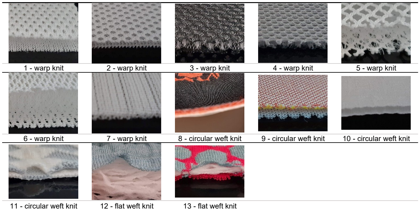
Table 1. Overview of 3D samples (warp and weft knitted samples).

The samples are made of 100 % synthetic material. Fehler! Verweisquelle konnte nicht gefunden werden. shows the results of the tests and demonstrates that there is no correlation between thickness and air permeability of samples. Furthermore, the pore size of the top and bottom layer is equally important for air permeability. The spacer textiles with spacer yarn show a very good recovery of the fabric after 1 min applying pressure of 10 kPa (98 % on average) compared to the 2-ply knitted fabrics. The compressibility correlates with the fineness of the monofilament in the spacer (cf. sample 3,5,6).